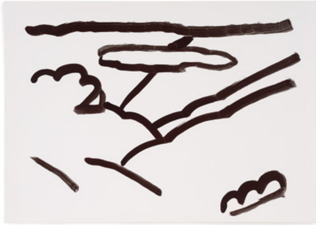
Mathon_View to the South, 2018, acrylic on paper, 30×42cm