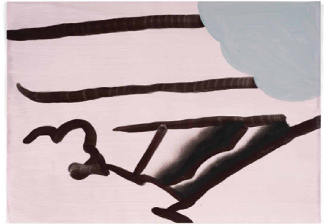
Untitled , 2018, acrylic, charcoal on paper, 30×42cm